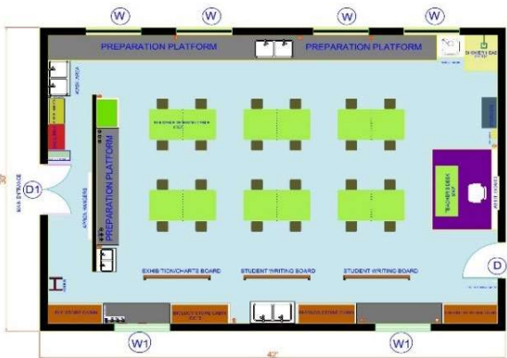
Figure 2: Sample floor plan-Model 1