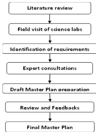
Figure1: Methodological flowchart